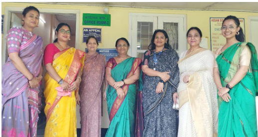
Visit to CCI in Kamrup Metro district of Assam