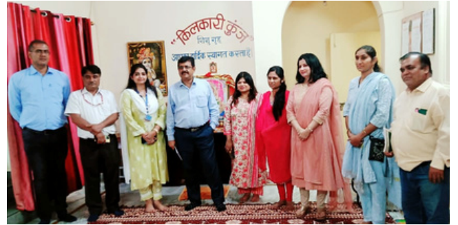
Director CARA visited SAA, Matr Chaya in Bhopal