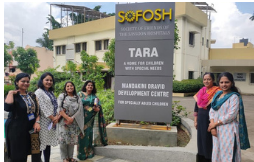
Visit to CCI – TARA (a Home for children with Special Needs), Pune