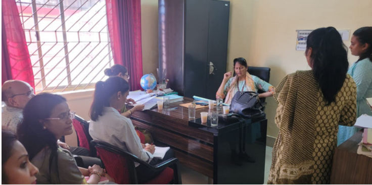
CEO CARA visited Maa Vaishanvi Trust (Balashray) Child Care Institution, Ranchi