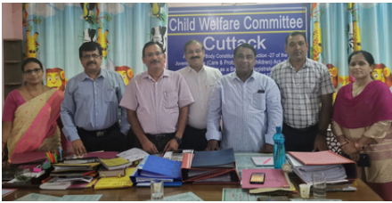
Director CARA, during meet with members of CWC, SARA and DCPU, Cuttack